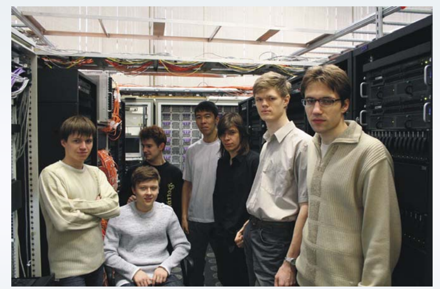
HP Cluster in JSCC RAS (#2 in CEE) 140 TFLOPs