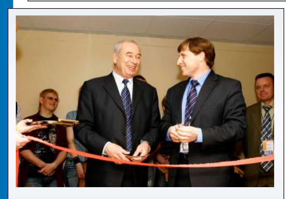
Opening of HP RIT Center (50 m<sup>2</sup>, 12 work places)