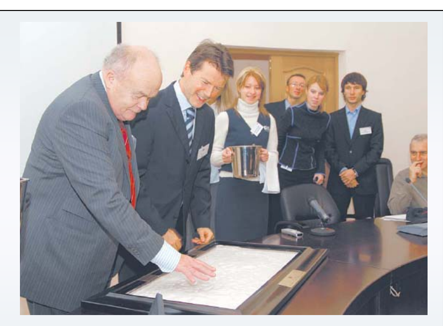
Opening of HP NGDC in Kurchatov Institute