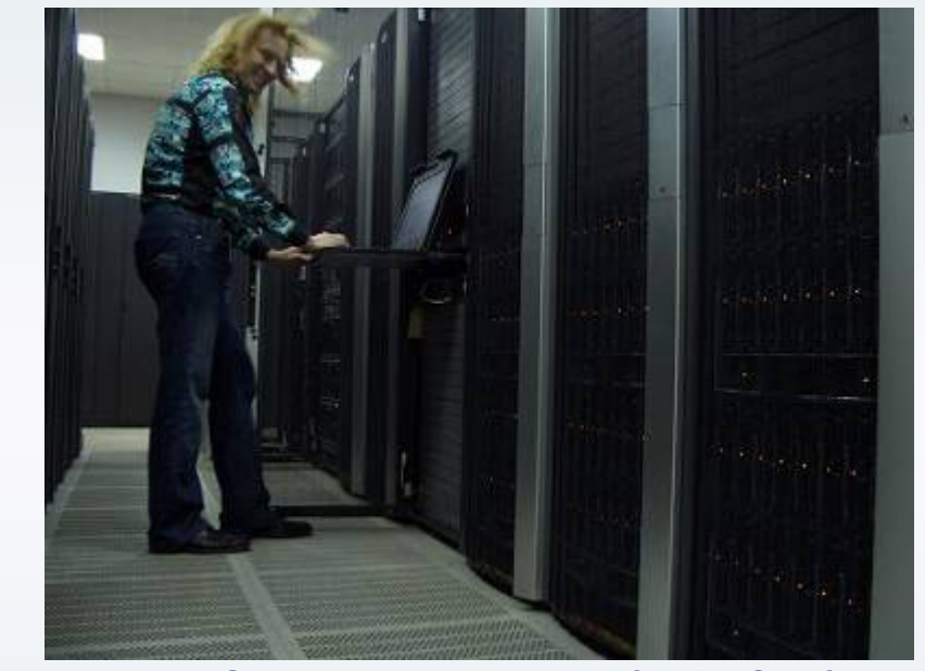
HP Cluster in Kurchatov (#3 in CEE) 35 TFLOPs (120 TFLOPs in CY09)