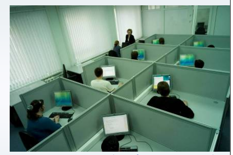
HP Innovation Lab (55 m<sup>2</sup>, 12 work places)