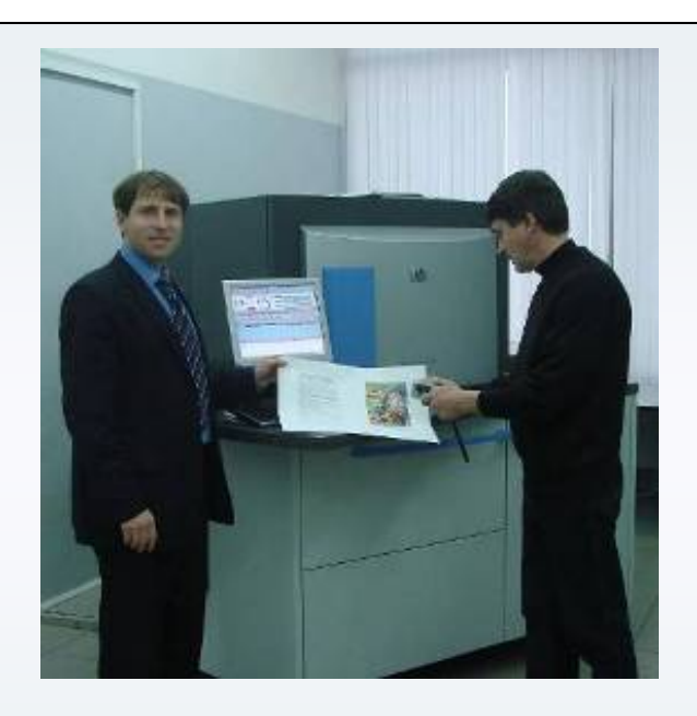
HP Indigo Lab